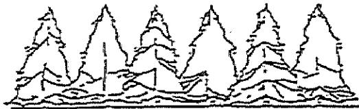
TALL EVERGREEN TREES, STAGGER PLANTED, WITH BRANCHES TOUCHING THE GROUND. SEE PLANTING LIST

Inspector, which under normal growing conditions, will attain a minimum height of eight (8) feet and a canopy spread of ten feet within four (4) years. They shall be planted a minimum twenty (20) feet on center as shown in the following illustration.