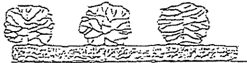
6' HIGH EVERGREEN SCREENING SHRUBBERY PLANTED 4' ON CENTER. SEE PLANTING LIST